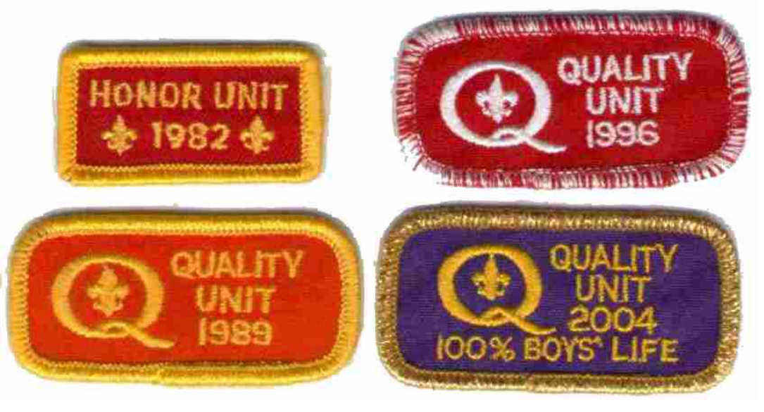
Quality Unit Patches are a Fun and Inexpensive Starting Collection

Particularly if you are willing to accept used patches, you will be amazed at all of the great old BSA history that you can find with a very small investment. You will find all of these items available for higher prices, but if you keep