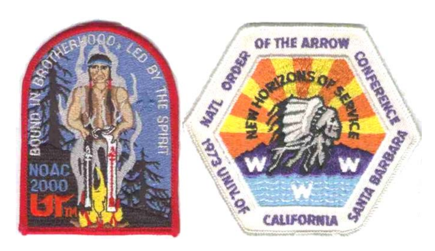
National Order of the Arrow Conference Patches

People collect BSA handbooks, Scoutmaster Handbooks, fiction books, song books, merit badge books, and so on. People collect Boy Scout, Girl Scout, Cub Scout, Explorer, Air Scout, Sea Scout, and international Scouting items. People collect knives, axes, rifles, pins, mugs, conclave, red and white council strips, Lone Scouts, Philmont, Schiff, Northern Tier, neckerchief slides, region, Baden-Powell, Scout stamps, Scout coins, uniforms, plates, statues,