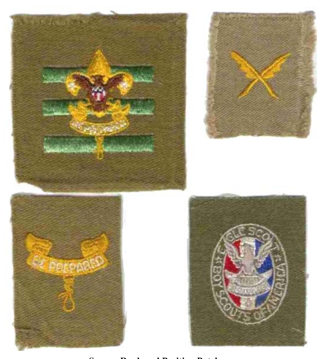
Square Rank and Position Patches