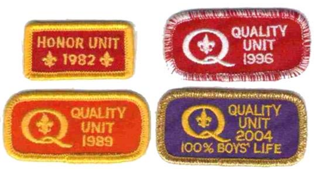
Honor and Quality Unit Patches

Position patches are also popular: Patrol Leader, Senior Patrol Leader, Scoutmaster, and District, Council, and national level patches and pins from the past through the present.