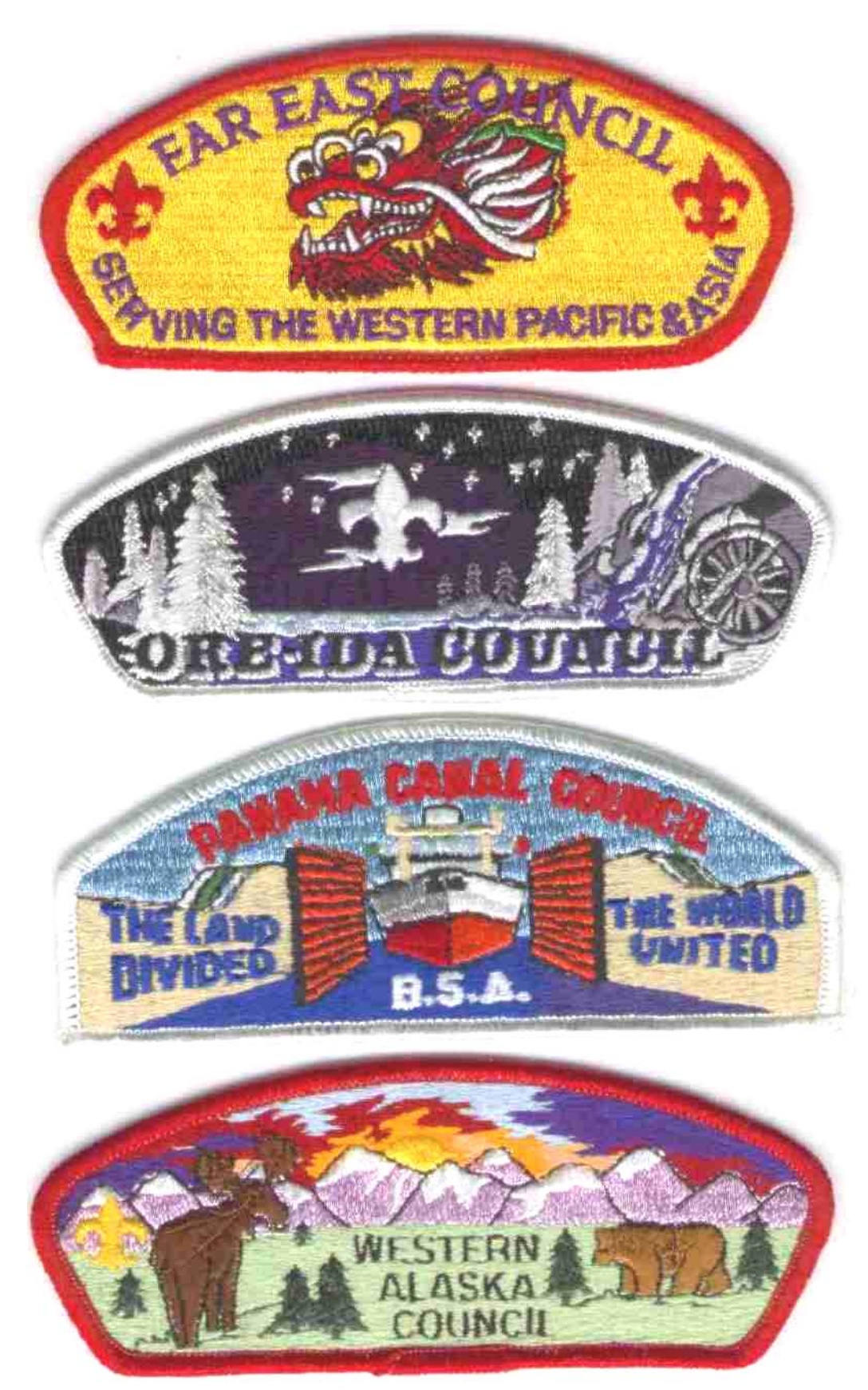
Council Shoulder Patches or CSPs