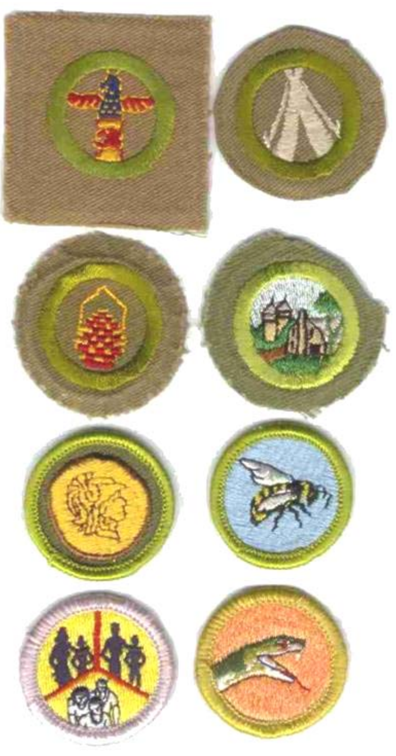
Square, Crimped, Twill, and Solid Merit Badges

People collect all kinds of various patches: popcorn patches, quality unit patches, old and new patrol patches, patches with cartoon characters, and so on. These can be fun to collect because they are often fairly easy to obtain.