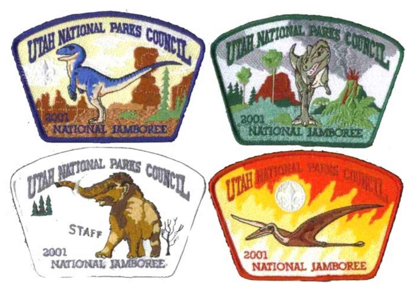
Part of a Set of Jamboree Shoulder Patches or JSPs

patch. Some of the oldest merged lodges never issued flaps. A few lodges issued only neckerchiefs.