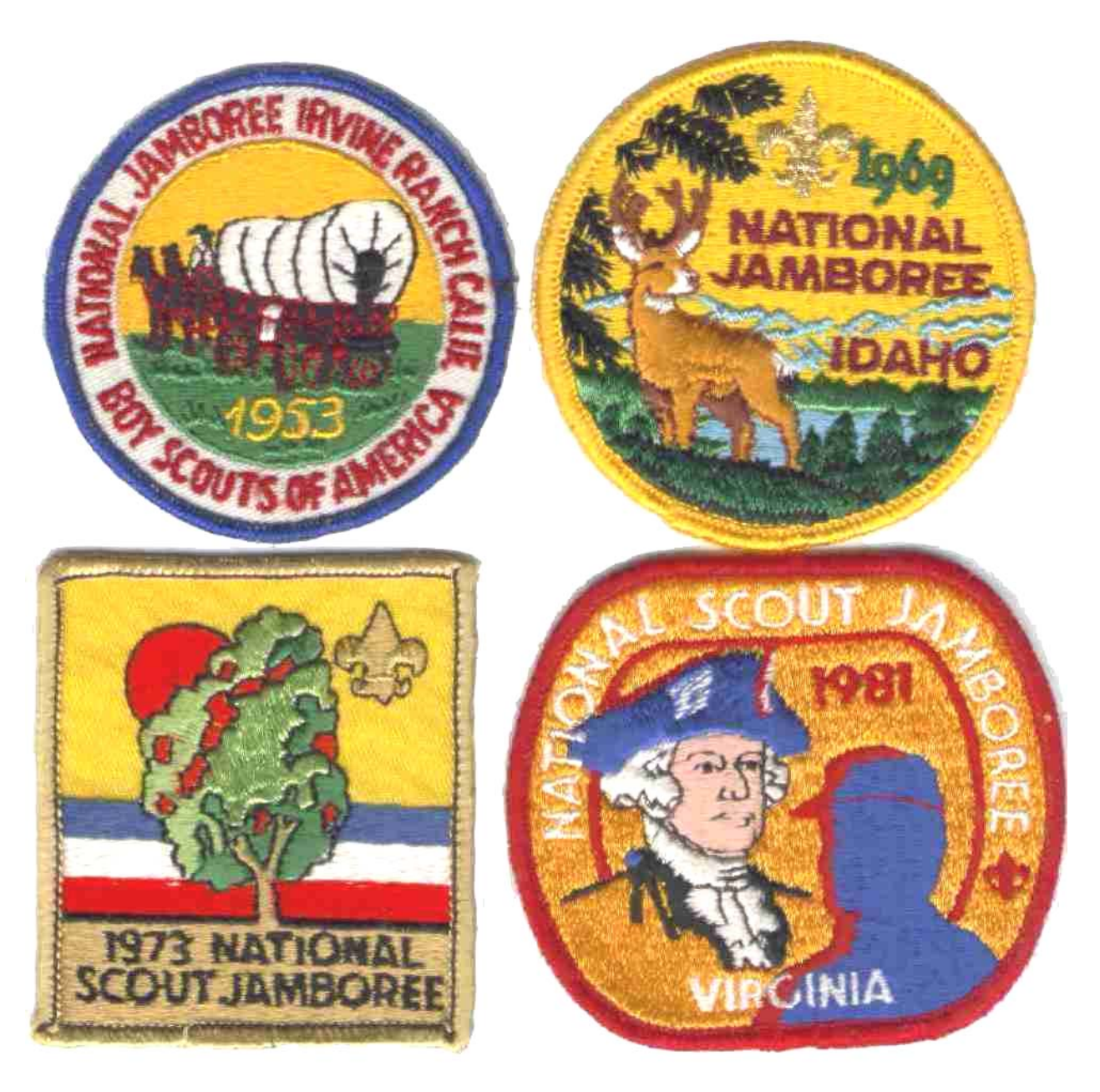
A Few National Jamboree Pocket Patches

Another popular area is Jamboree collecting. People collect Jamboree pocket patches, neckerchiefs, back patches, leather patches, and anything else issued for both National and World Jamborees. Similarly, people collect National Order of the Arrow Conference patches, neckerchiefs, and so on.