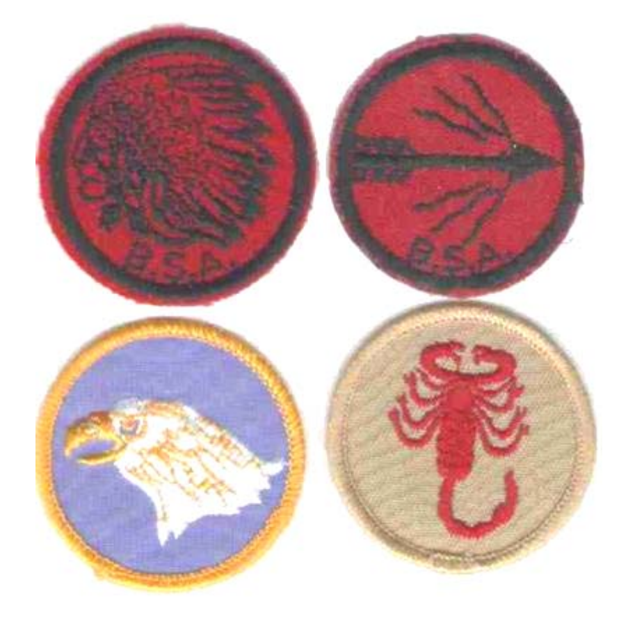
Older and More Recent Patrol Patches