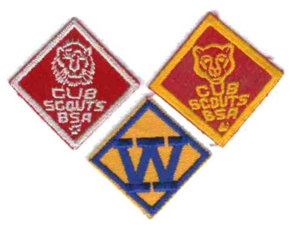
Older Cub Scout Patches

People collect BSA handbooks, Scoutmaster Handbooks, fiction books, song books, merit badge books, and so on. People collect Boy Scout, Girl Scout, Cub Scout, Explorer, Air Scout, Sea Scout, and international Scouting items. People collect knives, axes, rifles, pins, mugs, conclave, red and white council strips, Lone Scouts, Philmont, Schiff, Northern Tier, neckerchief slides, region, Baden-Powell, Scout stamps, Scout coins, uniforms, plates, statues,