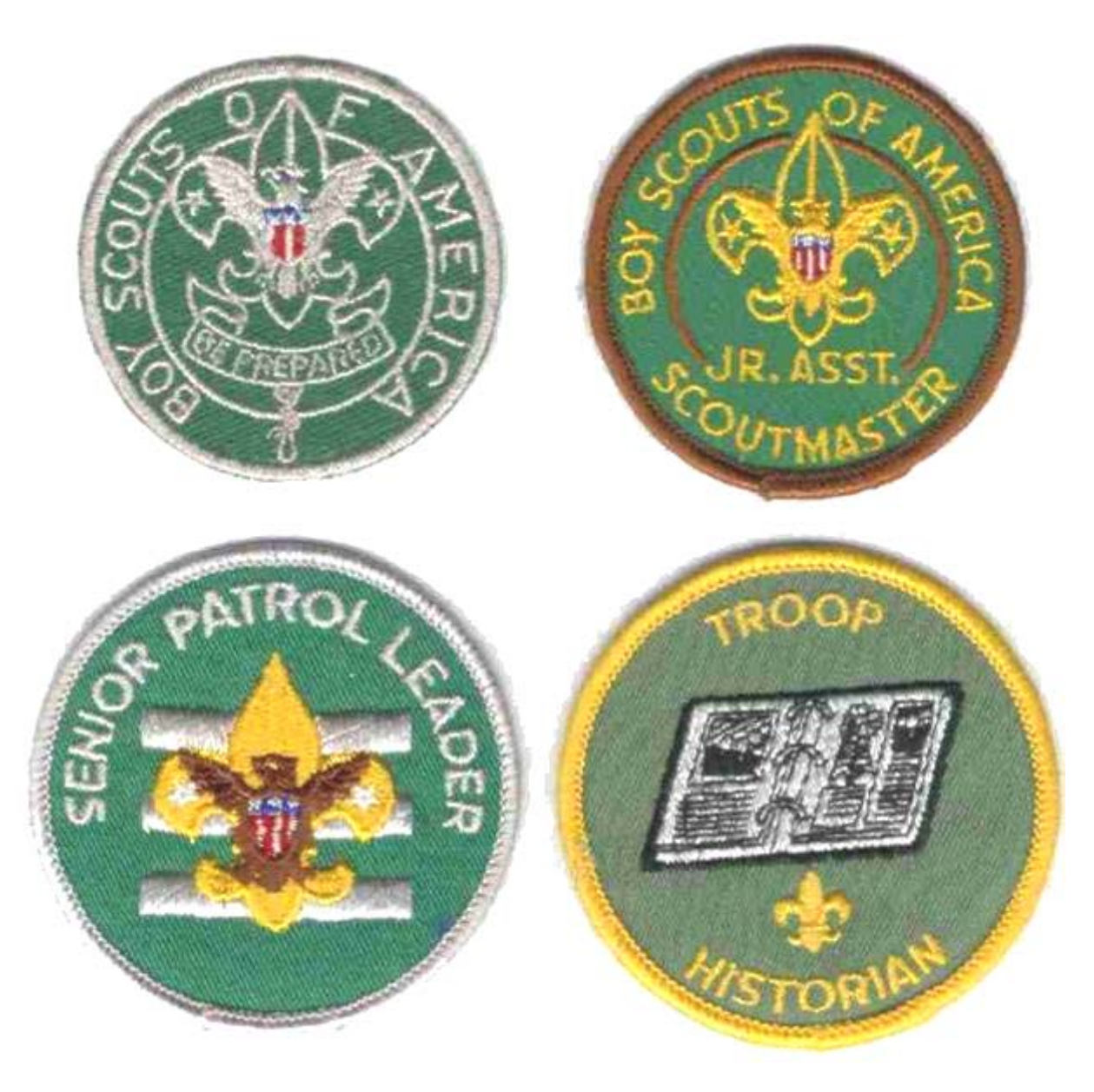
Older and More Recent Position Patches