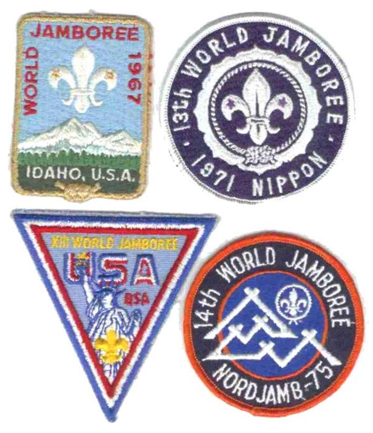
A Few World Jamboree and World Jamboree Contingent Patches