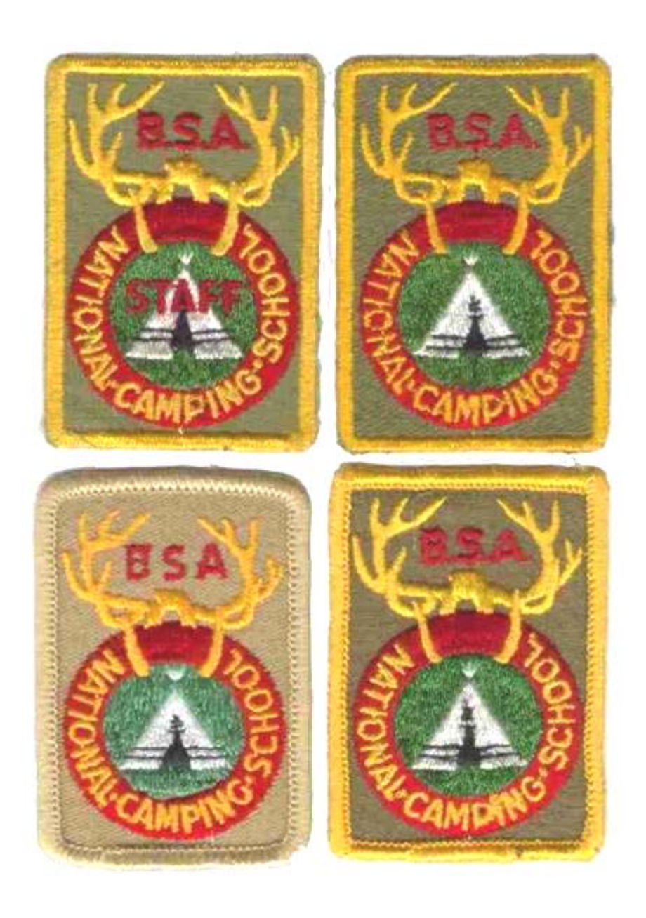
National Camping School