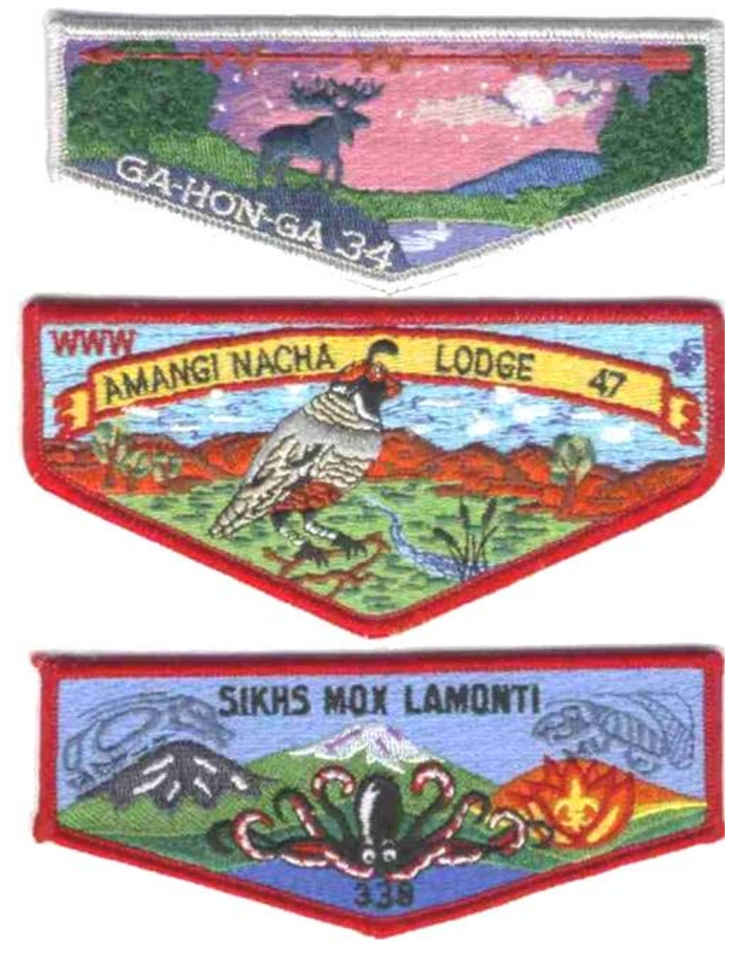
OA Lodge Flaps

Perhaps the most popular type of BSA collection is OA patches. You may want to try to collect as many different patches as you can from your own lodge. Some people collect OA patches from their state or from the lodges that attend their section conclave. As your collection grows, you may decide to get one patch from every current lodge. Some lodges no longer exist for a variety of reasons. They may have merged with other lodges to form a new lodge. Sometimes a smaller lodge simply becomes part of a larger lodge. Sometimes a lodge changes its