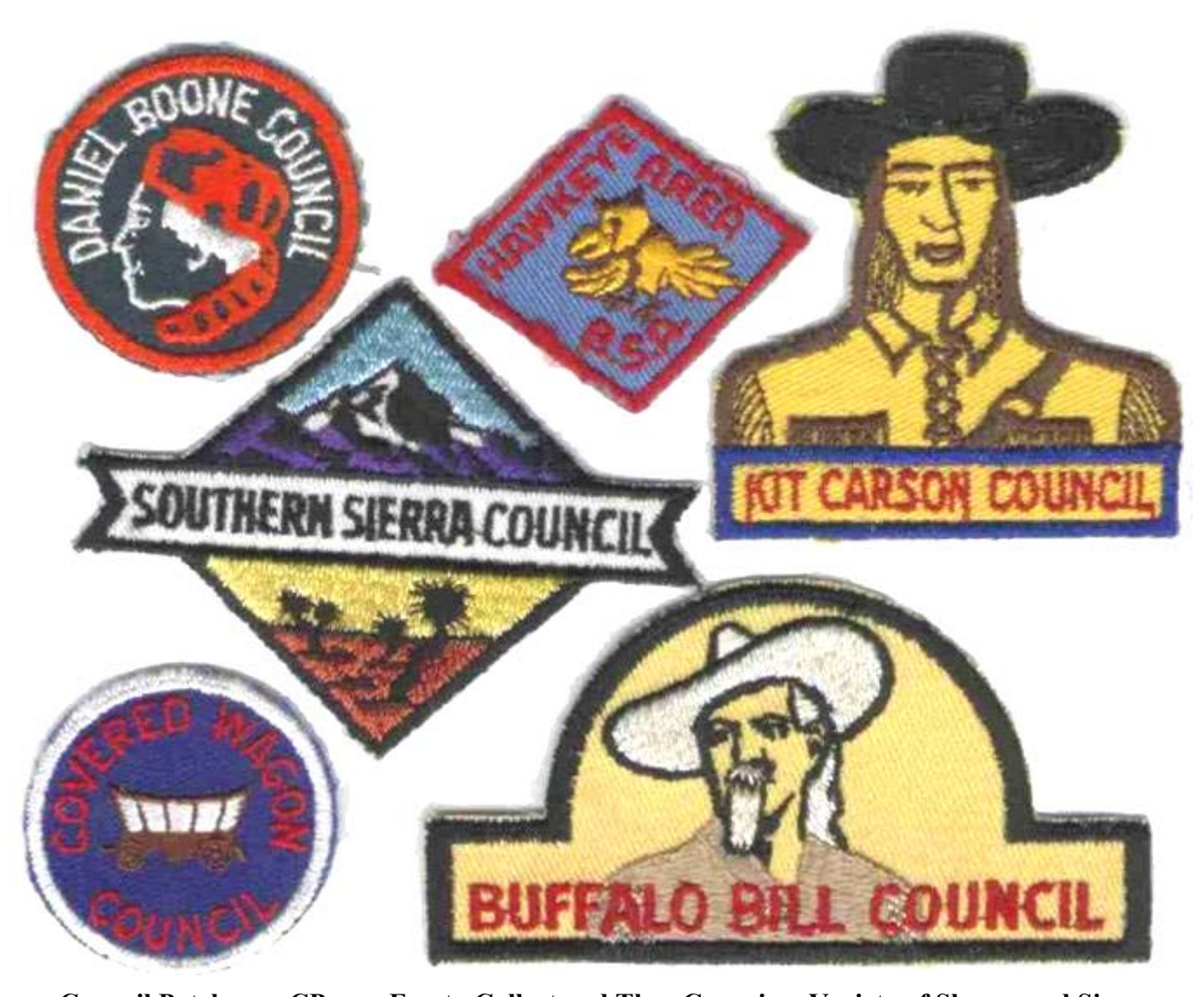
Council Patches or CPs are Fun to Collect and They Come in a Variety of Shapes and Sizes