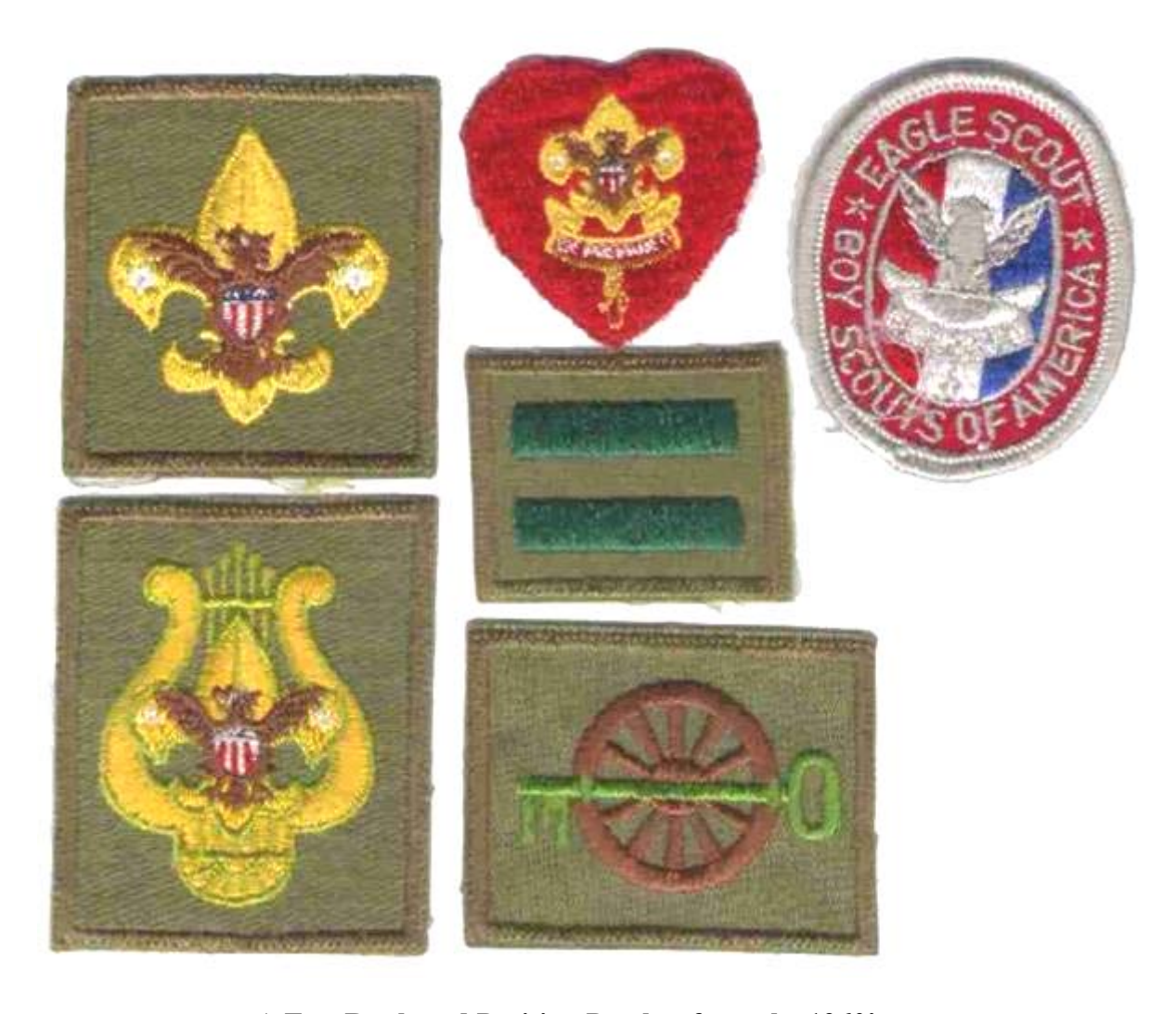
A Few Rank and Position Patches from the 1960's