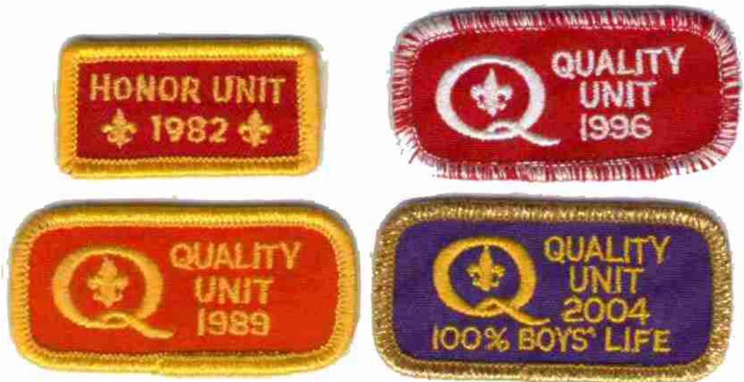
Quality Unit Patches are a Fun and Inexpensive Starting Collection

Particularly if you are willing to accept used patches, you will be amazed at all of the great old BSA history that you can find with a very small investment. You will find all of these items available for higher prices, but if you keep